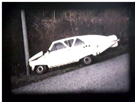
Aérofiat 2.1 - 1995 «The running gear and completed vehicule, shown during one of its very first outings», 1995