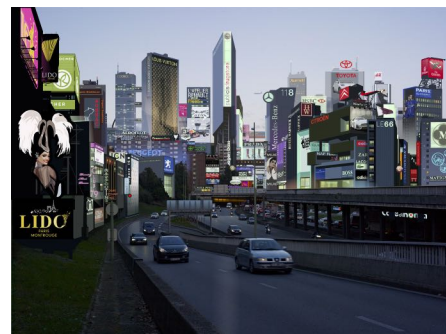
Plan Voisin de Paris - V2 Circulaire Secteur A23, 1995

Alongside the images of Plug-in City (2000) and the Plan Voisin , we look again at the Mont Fuji series (when Switzerland meets Japan) and An American Landscape (when Rambo is shot in Savoie). They inhabit the memory of the walls. In the musical chairs of hang arrangements, and of reincarnation, they sometimes reinstall themselves in the very spot where they have already been shown, or elsewhere. A romantic in the city.