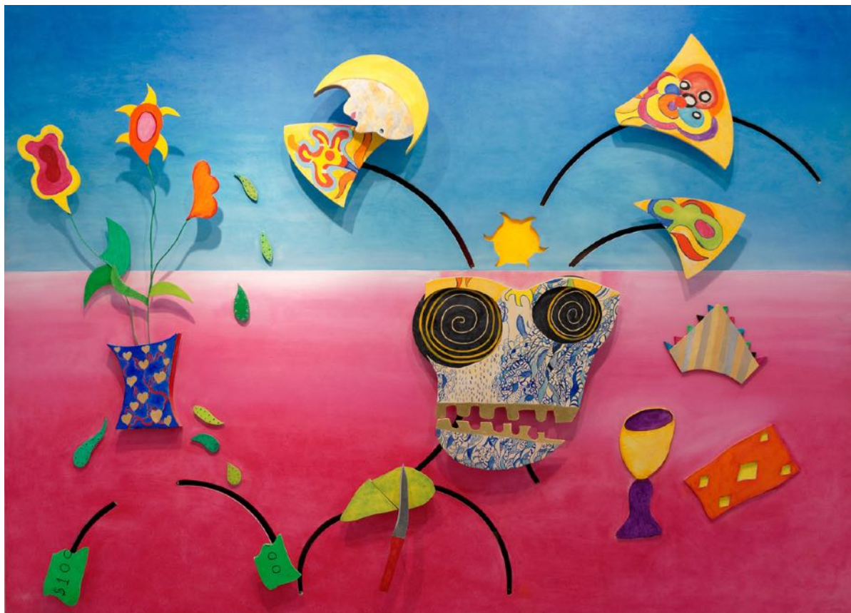
Niki de Saint Phalle, I woke up last night , 1994