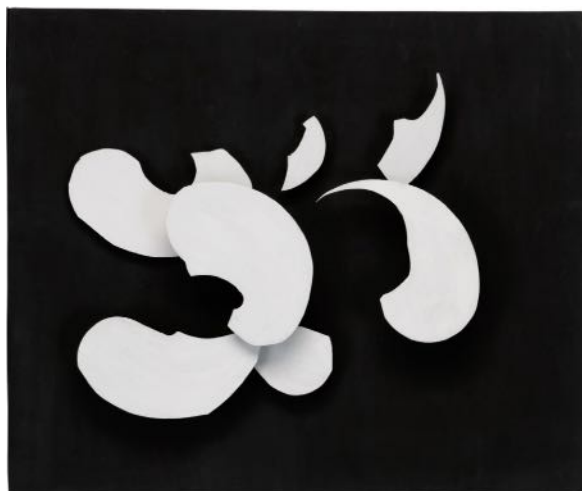
Jean Tinguely, Incertitude No. 5 , 1958

Niki de Saint Phalle's Tableaux Éclatés are an homage to Tinguely's moving paintings – using her distinctive imagery and joyful color palette, she explores symbols of life, death, sex, and rebirth in a bittersweet echo of Tinguely's works – in I woke up last night , the sun, the moon, flowers, a knife cutting through a pear, and a dislocating skull are animated by a hidden mechanism evoking themes of loss, grief, healing, and remembrance.