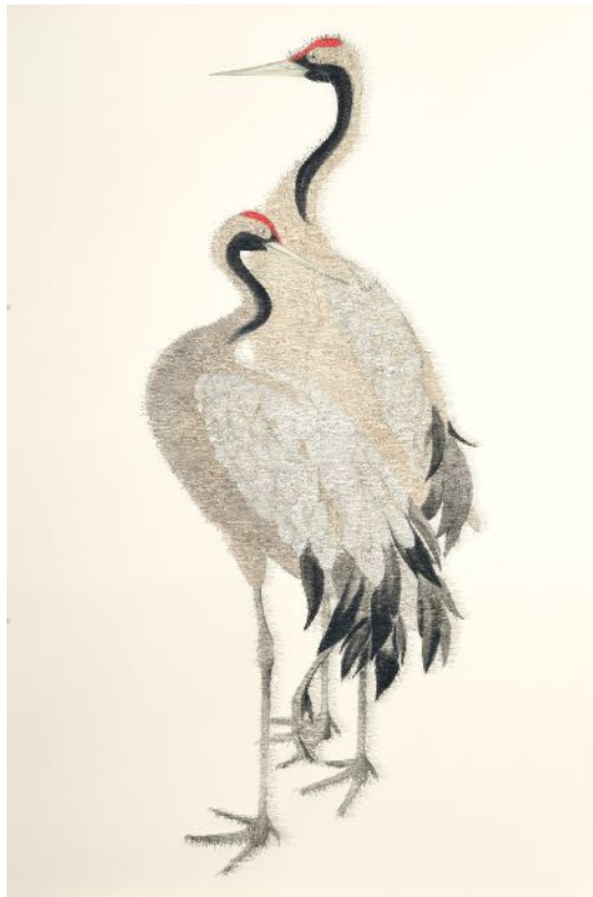
Pilar Albarracín, Garzas , 2023

Finally, contemporary Andalusian artist Pilar Albarracín's Garzas reproduces and enlarges a pattern found on Manila shawls, brocaded stoles closely associated with Spain, into a drawing which is then entirely covered in pins pierced through the back of the paper, adding a shimmering, ambivalent layer to the delicate drawing. The surface of the work transforms into a nearly weaponized version of embroidery, subverting expectations around a technique traditionally viewed as delicate and feminine.