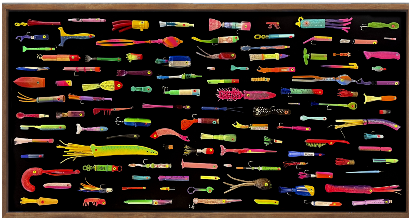
5 — Williamsburg Bridge, 2023