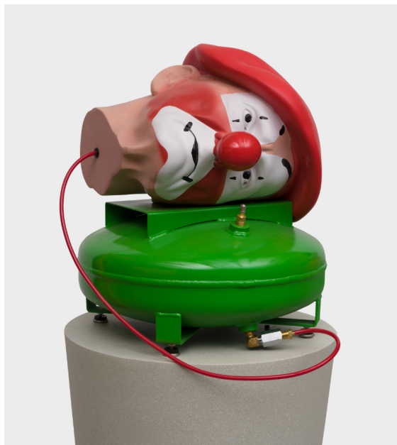
For Paris (Red) (detail)