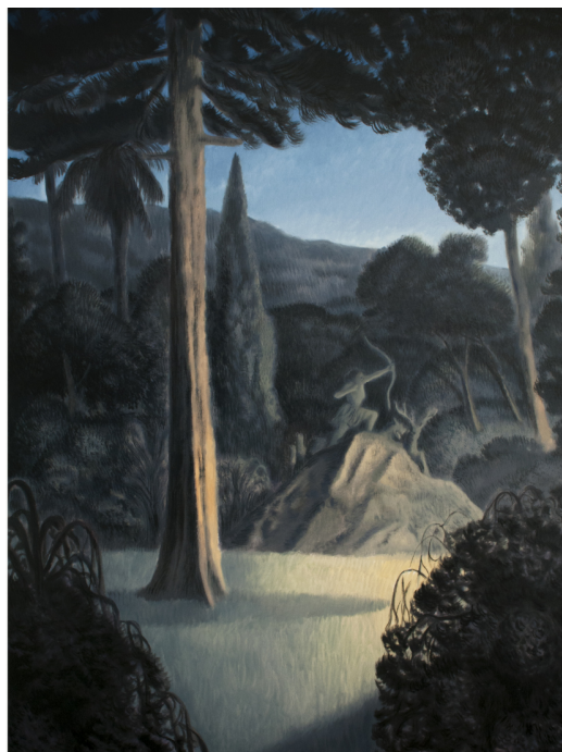
Iphigénie (projet de décor)