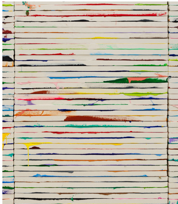
1000 Pictures (stacked paintings) (detail)