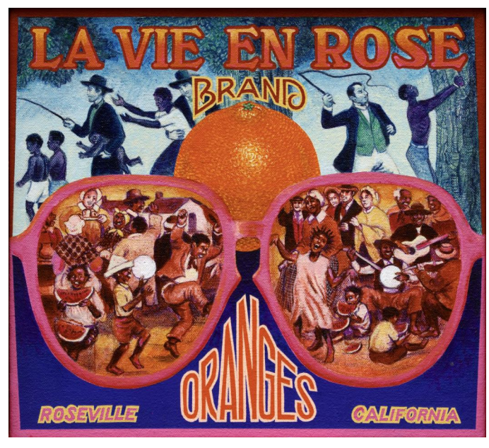
Excerpt from the text by Damien Aubel in the exhibition catalogue • Oranges • pancartes • cartes postales, co-published by Galerie GP & N Vallois & Les presses du réel, 2023