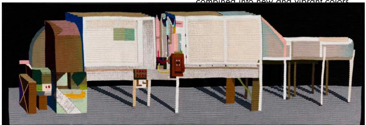
A Dog, 2021