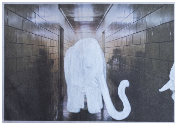
Agāpe , 2021

The LANDLORD enters and opens it. The LANDLORD exits, and returns with a saw to cut him down, during which time the chair and the CLOWN have descended; the CLOWN and the LANDLORD seat themselves at the table, when it ascends gradually, and presents a first, a second, and a third tier of tables, covered with cloths, furnished exactly as the first, with two wax lights to each; the CLOWN and the LANDLORD separate them, when PANTALOOON, LANDLORD, and CLOWN place themselves at the respective tables, the CLOWN in the centre, and all three tables in a line with PANTALOOON, CLOWN, and LANDLORD who ascend together at a height of six or seven feet, when the CLOWN, forgetful of his own situation, is laughing at his neighbor's. HARLEQUIN and COLUMBINE enter, when another table, to represent a small dining one, is brought on; HARLEQUIN touches it, and a complete supper appears on it, lit up with six candles, at which instant the candles on the other three tables disappear. Scene changes to: