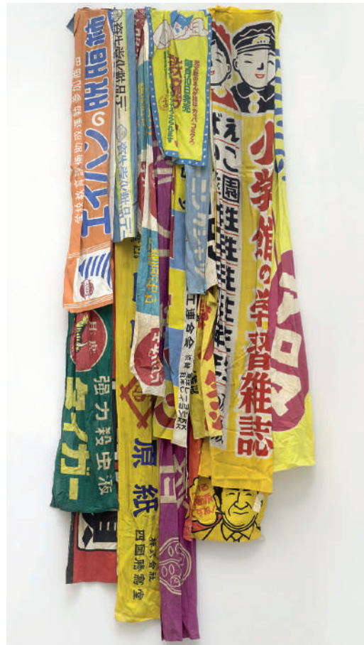
Gérard Deschamps, Trademark, 1963

Extract of Catherine Millet's text in the book published on the occasion of the exhibition.