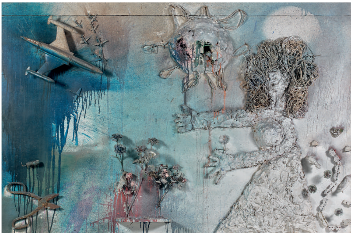
Niki de Saint Phalle, Tir Avion, 1961