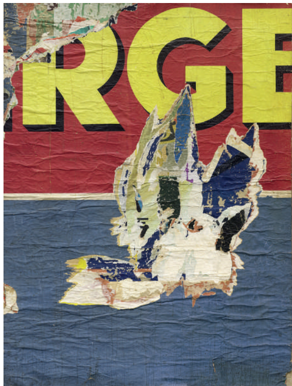
Jacques Villeglé, Avenue de l'observatoire, 1961

To use today's term, they were recycling. And they were trying to answer this question: what else can we do, which is not imposed on us, with the Real that we cannot escape? It is this realisation - that we cannot escape it - which is truly "Realist". (...)