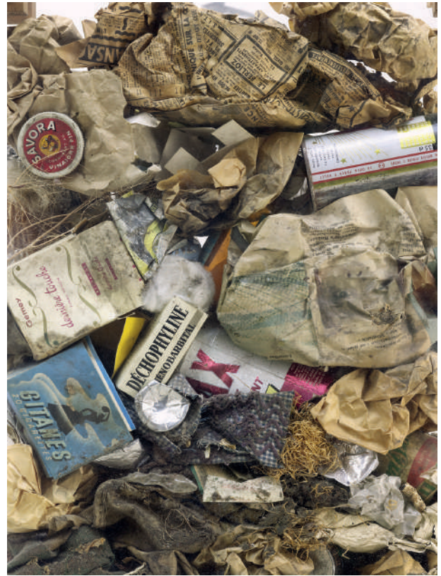
Arman, Déchets Bourgeois (detail), 1959

The New Realists found much of their raw material, which they used or abused, at flea markets, in car scrapyards, on waste ground and along the board fences erected to conceal waste ground from view, and even in convenience stores and "pound shop" type stores. However, the ultimate aim of their actions was not to deny reality.