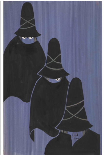
Three robbers, c.1960

Without boundaries, without shame, without restrictions, Tomi Ungerer has never limited himself to a single medium nor a single mode of expression. He was always ready to tackle everything!