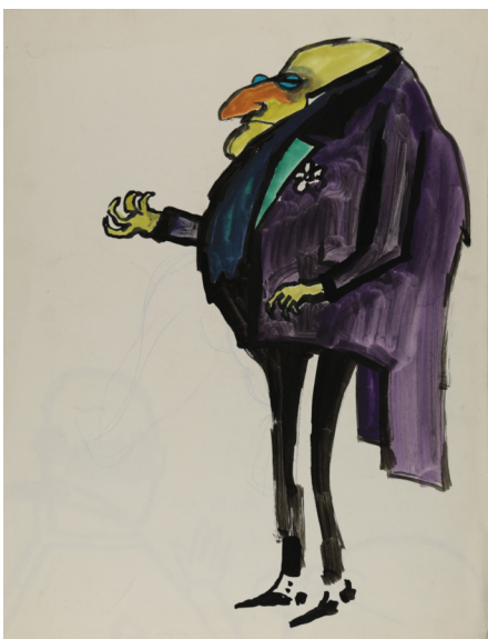
Untitled (series « The Seven Deadly Sins »), 1960