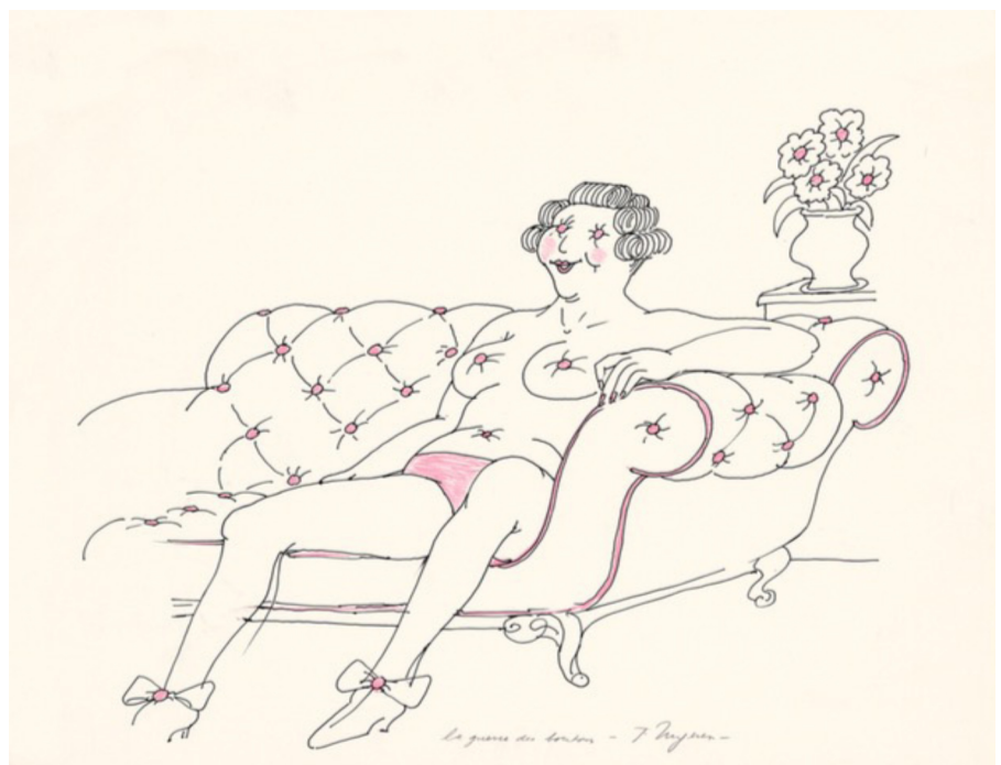
War of the Buttons, 1970-1