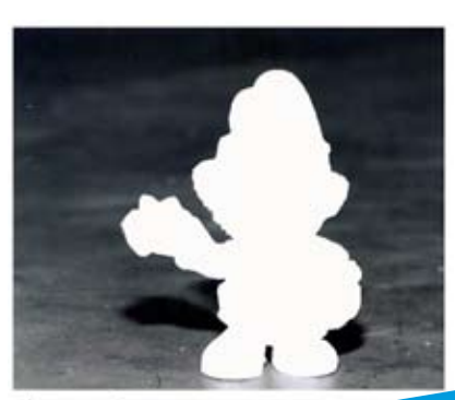
le reve de Damion

5 MAY - 3 JUNE 2007 OPENING FRIDAY 4 MAY 2007