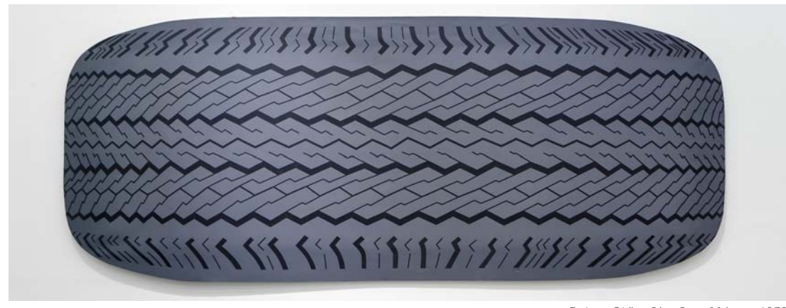
Peter Stämpfli, Cavallino, 1972

For the second year in a row, our booth at the Fiac art fair, with its staircases and disconnected spaces, looks more like a Parisian apartment than a classic white cube, letting us deploy the various facets of our programming, mixing generations from the avant-garde 1960s to emerging artists.