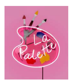
FORTHCOMING GALLERY 36