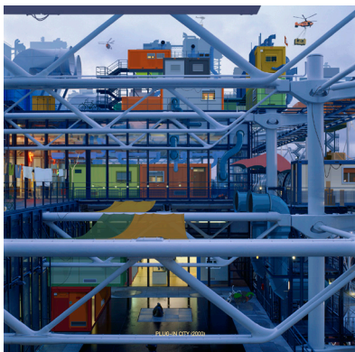
Alain Bublex, Plug-in City (2000) MNAM, 2009