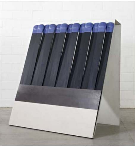
Raymond Hains, Seita, 1966