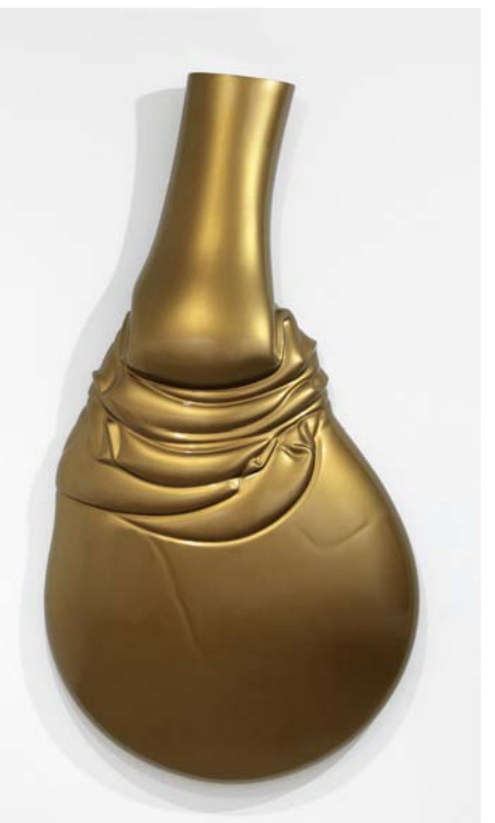
César, Expansion n°1, 1969