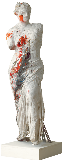
Niki de Saint Phalle