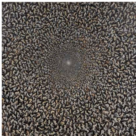
Peybak, Abrakan #56 , 2016