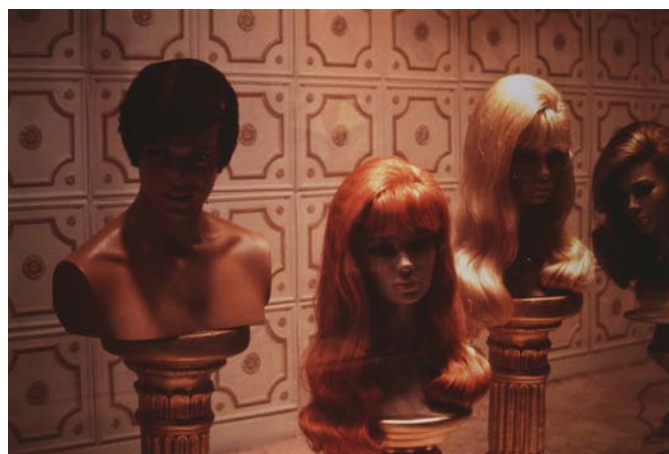
Paul McCarthy, Fear of Mannequins, Wig Heads, Hollywood Boulevard, 1971