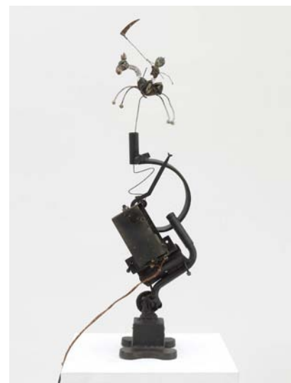
Jean Tinguely, Vive la Muerta , 1963