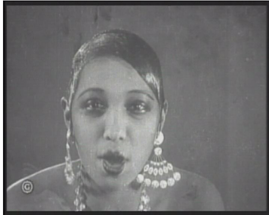
The Word, 2005, vidéo