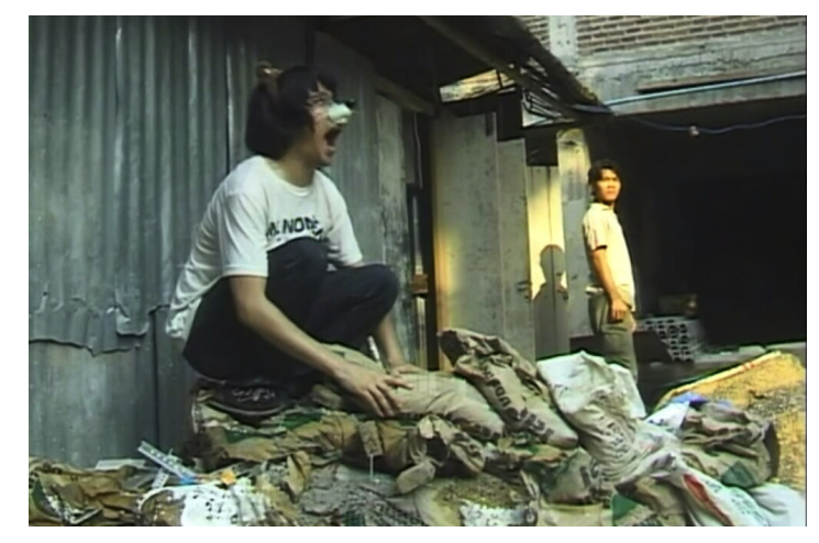
The Upper Eyelid, video, 2014

"It was last December in Paris, while I was on the banks of the Seine in the middle of the night, that I realized that in order to apprehend a video, it was better to do it at night. It was a Sunday evening; there were few people, the wind was blowing and shaking the metal gates of the storefronts. Rats were perceptible, they were passing near by in the shade. All these microevents were creating an atmosphere and I was wandering, alone, in search of these "pieces of atmosphere" that I was filming as best as I could.