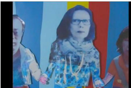
Small world, 2008