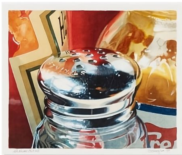
Ralph Goings, Shaker Detail, 1999

The half-dozen terms used for the "Photorealist" or "Hyperrealist" movement (...), the number of texts written about the reasons for choosing one or another of these terms, and the number of criticisms coming from the artists in the movement, make this one of the most interesting examples of a "false" movement to be found in art history. Is it legitimate to bring together artists who, without knowing each other, worked on similar subjects using similar techniques? The many recent exhibitions and the discovery of later generations appear to validate the choice made by the critics and gallerists who invested in this gathering. The questioning of the movement – real or fake? – echoes the question raised by the movement itself, and it's no coincidence: are these paintings made after photographs merely "cold" copies – in other words, a kind of realism – or are they the beginning of a narrative, and therefore a form of unreality? True or false images? True or false movement?"