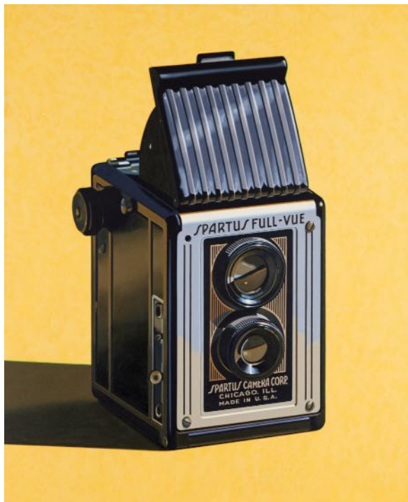
Spartus Full view, 1999

Excerpts from Alain Cueff's text "Des enseignes aux signes - Éléments de la peinture de Robert Cottingham" to be published in the exhibition catalog