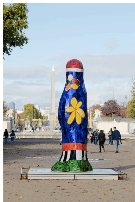
Niki de Saint Phalle, Obélisque bleu avec fleurs , 1992

This work, exhibited in the Tuileries Garden (a stone's throw from the Luxor Obelisk it parodies) is the greatest and most monumental example of the series of obelisks created by Niki de Saint Phalle in the 1980s and 1990s. It displays the mirror mosaic technique invented for her famous Tarot Garden , created in Italy between 1979 and 1993.