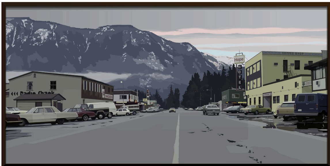
Alain Bublex, An American Landscape - A distant siren (!) , 2022