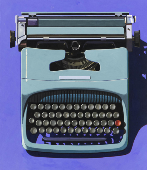
Andre's Olivetti, 2008 Gouache sur papier / Gouache on paper