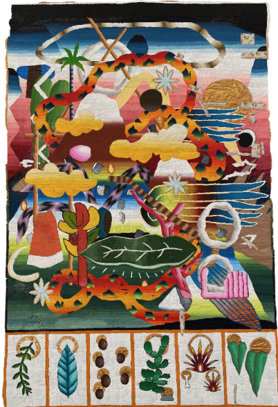
Une histoire de canonisation, 2019