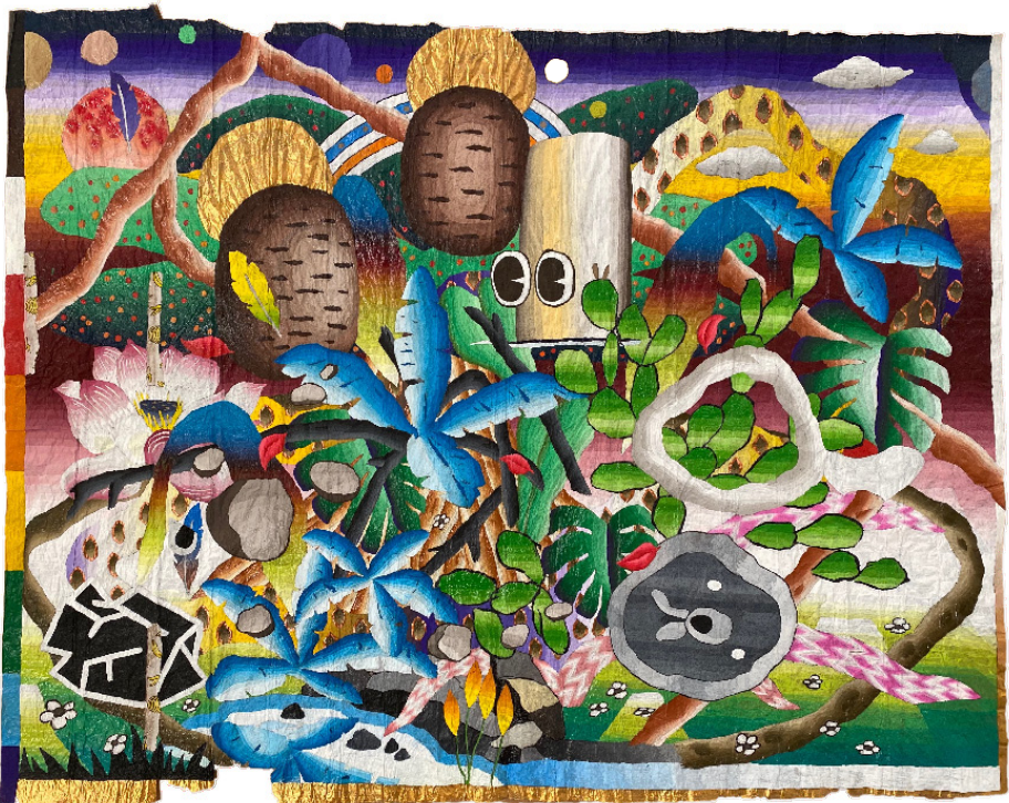
C'est toujours un plaisir de les voir par ici, 2019