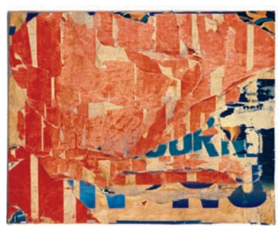
Jacques Villeglé, Rue du Figuier, Juillet 1961

The gallery will present at the Armory Show two historic works from the 60s.