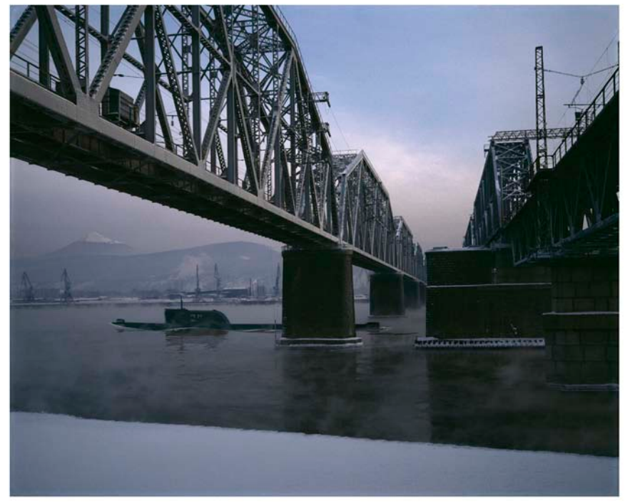
Alain Bublex, P58 Mont Fuji Ienissei, 2009

Alain Bublex is currently at the Centre Pompidou in a solo show : Habiter 2050, until 8 March 2010.