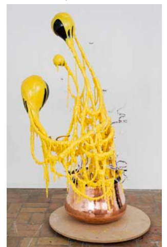
Gilles Barbier, In the soup, a cheddar fondue and three nightmares, speach bubbles (tenant & owner), isolated segments (the infinite assassin) and bananas, 2010