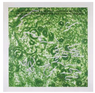
Gilles Barbier. In the Soup. Spinach & Broccoli, 2009

FOR VISUALS. PLEASE CONTACT THE GALLERY ON +33 1 46 34 61 07 OR INFO@GALERIE-VALLOIS.COM