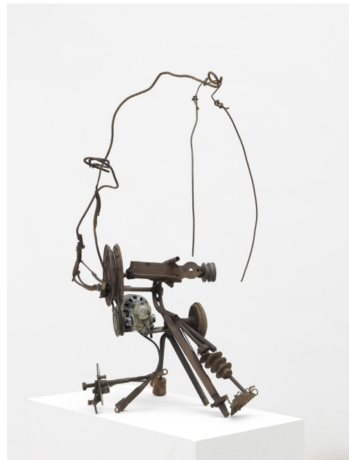
Vive la Liberté I 1960