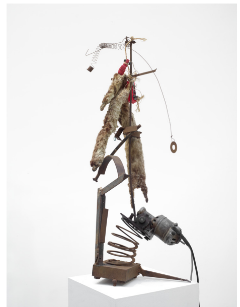
Fourrures n°3 (série des Baluba) 1962