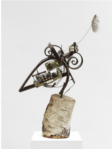
Radio "Dindon" 1962

What today we perceive as fully constituted movements, with their lists of artists, their critics and their exhibitions, were at the time transient and malleable, as likely to disintegrate as to gel, denounced by those who had only just theorised them: Pop and Nouveau Réalisme, happenings and Junk Art, Lettrism and concrete poetry, concrete music and electronic music, dance and performance, the museum and public space, Fluxus and Dada - all these phenomena were still in gestation.