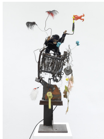
Wackel Baluba 1963