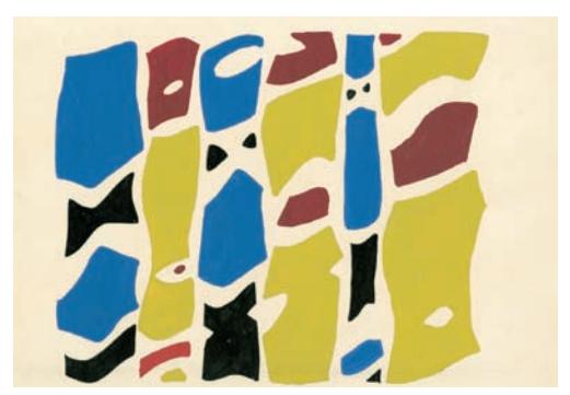
Pénélope (essay) 195

An exhibition by Jacques Villeglé (with the collaboration of Raymond Hains)