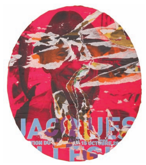
Opération Quimpéroise, Esplanade François Mitterrand, 2006

This film would have been the outcome of a series of procedures that it would take too long to describe here, of which we note the conception of an Hypnagogoscope (a new kind of camera furnished with fluted lenses), gouache painting, numerous preparatory drawings, collages, engravings, animated film techniques, etc. The pieces exhibited come from the Jacques Villeglé's precious archives. With regard to the fragments of film produced, along with the diverse elements employed, it has often been said that they are abstraction, that the fluted lenses in particular produce deformation and fragmentation, as had been the case during the same period with the letters of a phonetic poem by Camille Bryen, Hepérile (1950), to which our two accomplices had joyfully applied this technique for a result that they would call Hepérile éclaté (1953).