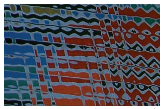
Pénélope (séquence inédite), 18 September 1953