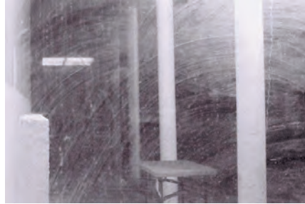
Une image occultée, 2016