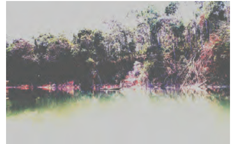
Une image voilée, 2016